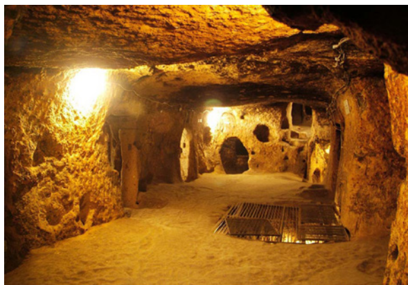
Cu Chi Tunnels, Ho Chi Minh City (Saigon)