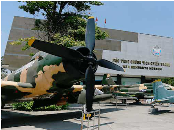
The War Remnants Museum, Ho Chi Minh City (Saigon)

Nui Ba Dan was a place where my dad also spent time and had memories. We took the gondola up about halfway and hiked around to the Buddhist Temple as it was Tet, the lunar New Year. We were to go to the first, higher temple. I continued up in the direction I was sent, but it led to the mountain summit. After about 200 meters, I realized it was not taking me to the temple, though I did get a strenuous workout. My dad sat on the temple steps and made friends with 15 high school kids who had just summited. He taught them the US Army term, "Hooah!" As I approached them, he counted down and they all belted it out! They also sang "Happy Birthday" to him.