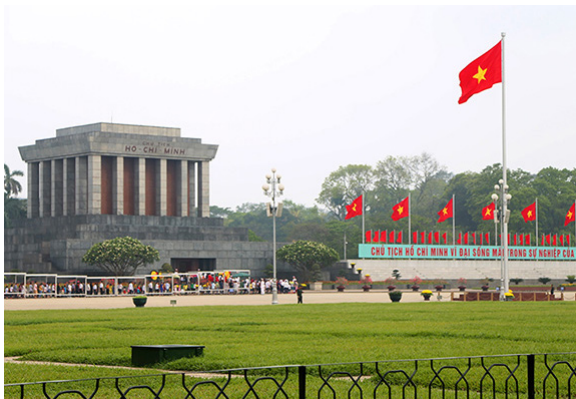
Ho Chi Minh Mausoleum

the US, it primarily housed pilots who'd been shot down. It is very historic. All US prisoners were released in 1973. Of course, the history and photos depict "kind" treatment of the POWs. The prison, still named Maison Centrale, French for "Central Home," sits in downtown Hanoi. It was a sobering place to visit.