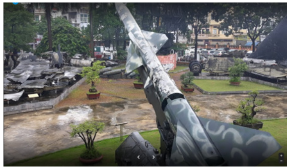
The remains of a USAF B-52 (upper left) and the Vietnamese anti-aircraft system that brought it down, just outside the B-52 Victory Museum in Hanoi.