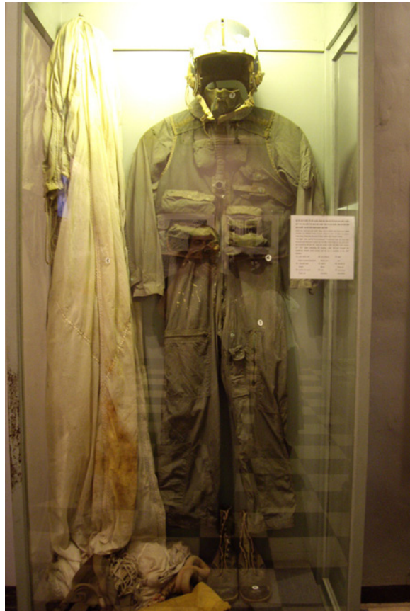
Photo top left: Maison Centrale (“Saigon Hilton”). The front gate, which is part of the few remaining portions of the prison. Photo right: John McCain’s flight suit, helmet and parachute at capture. Bottom left: Layout of the Maison Centrale (“Saigon Hilton”)