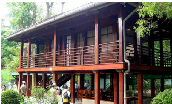
Ho Chi Minh Stilt House, Hanoi

From there, we went to the Ho Chi Minh Mausoleum and Complex. We saw Ho Chi Minh, lying in state. It's sacred to the Vietnamese, much like the Tomb of the Unknowns is for us. We then saw the Presidential Palace and learned Ho Chi Minh hadn't lived there but instead lived a small, austere home on the grounds. Eventually, to honor the people he lived with while in hiding in the mountains, he asked the government to build him a small home on stilts nearby.