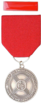
FIRE SAFETY COMMENDATION MEDAL

The Sons of the American Revolution (SAR) Public Service and Heroism Awards recognize and honors citizens and individuals in our public service sectors of Law Enforcement, Fire Safety, and Emergency Medical Services for their contributions to the community and for heroic acts with a commendation certificate and medal.