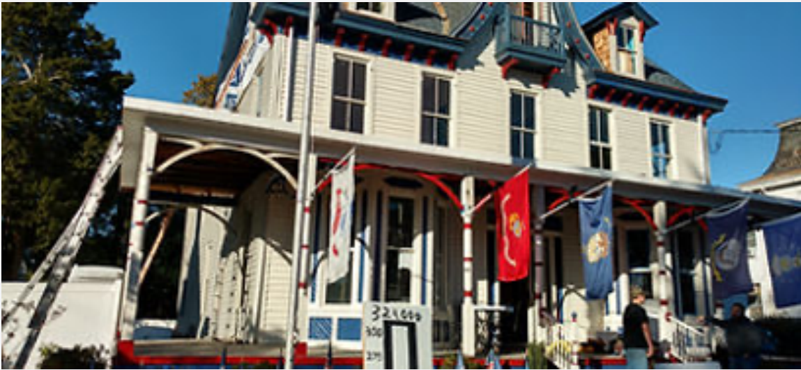
A photo of the new Veterans Resource Center as the facility was being re-furbished in 2013.