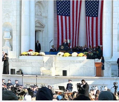
The annual VSO Arlington National Cemetery gathering had President Biden as the keynote speaker.